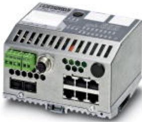
Ethernet Smart Managed Compact Switch with six 10/100/1000 Mbps RJ45 ports and two 1000 Mbps SFP slots

Please be informed that the data shown in this PDF Document is generated from our Online Catalog. Please find the complete data in the user's documentation. Our General Terms of Use for Downloads are valid ( http://phoenixcontact.com/download )